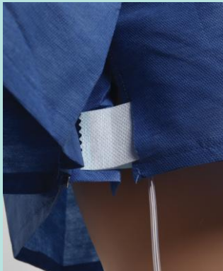
Magic clip secures foley catheter tubing in a patient friendly manner.