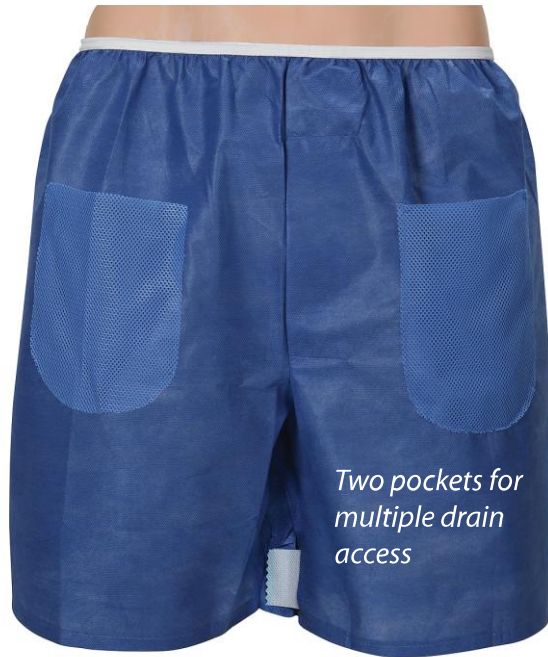
Two pockets for multiple drain access