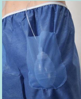
Front mesh pocket holds drain and promotes hands free ambulation. Easy access for drainage and catheter control.

A patient's sense of privacy and comfort is a significant influence in how they perceive their overall hospital experience.